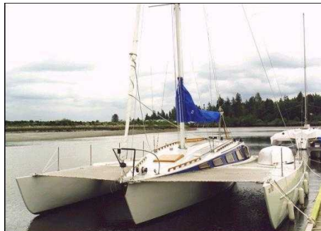
1987 Crowther Passagemaker 33ft Trimaran - $25,000 CAN OBO

33ft Trimaran, modified Bernie Rodriguez, presently moored at Wards Marina on Crescent Rd in Surrey BC