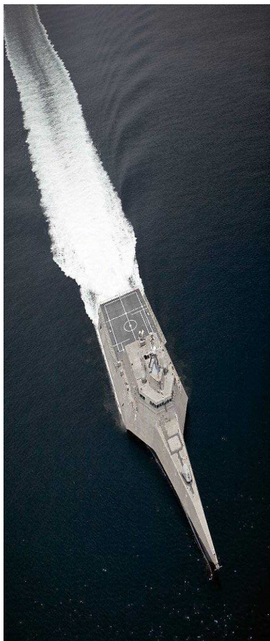
US Navy ship "USS Independence"

For more information, please see ship's website .