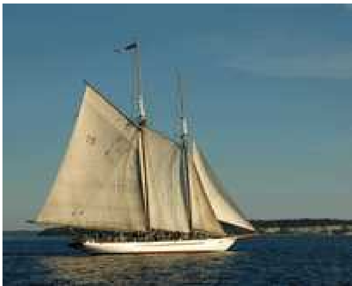
The 97 year old Schooner ADVENTURESS needs our votes.

More pictures and videos at BMW ORACLE Racing blog: http://bmworacleracingblog.blogspot.com/