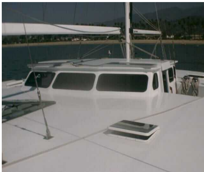
Photo of sister ship